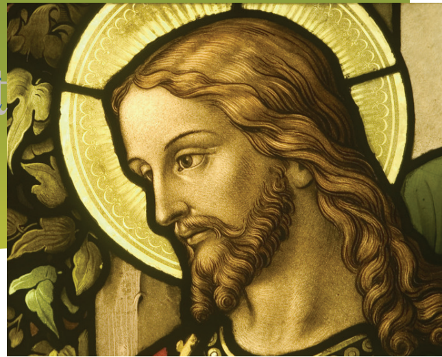
Confessing Jesus Christ as Son, Savior, and Lord!